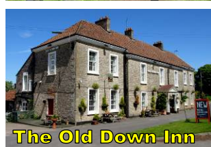
The Old Down Inn