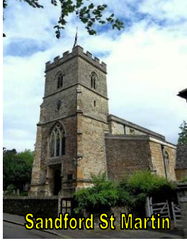
Sandford St Martin